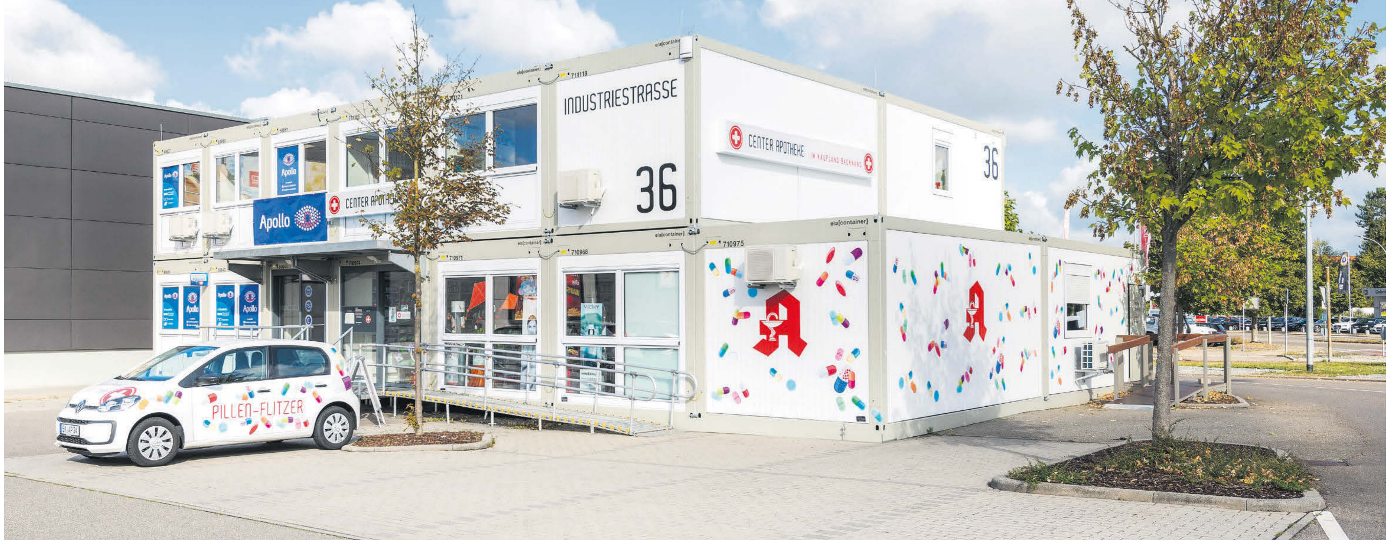
The shopping centre is undergoing renovation, but the opticians and pharmacy carry on their business in ELA retail spaces.

Pharmacy and opticians move into ELA containers