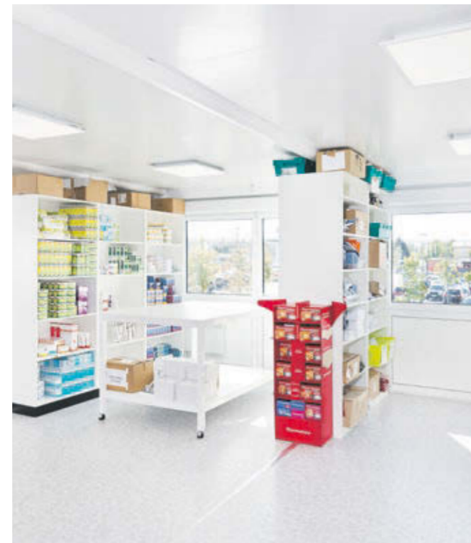
Fig. 1 The ELA room solution for retail is bright and modern.

Engineer Martin Fuchs – Köchel + Partner architecture firm