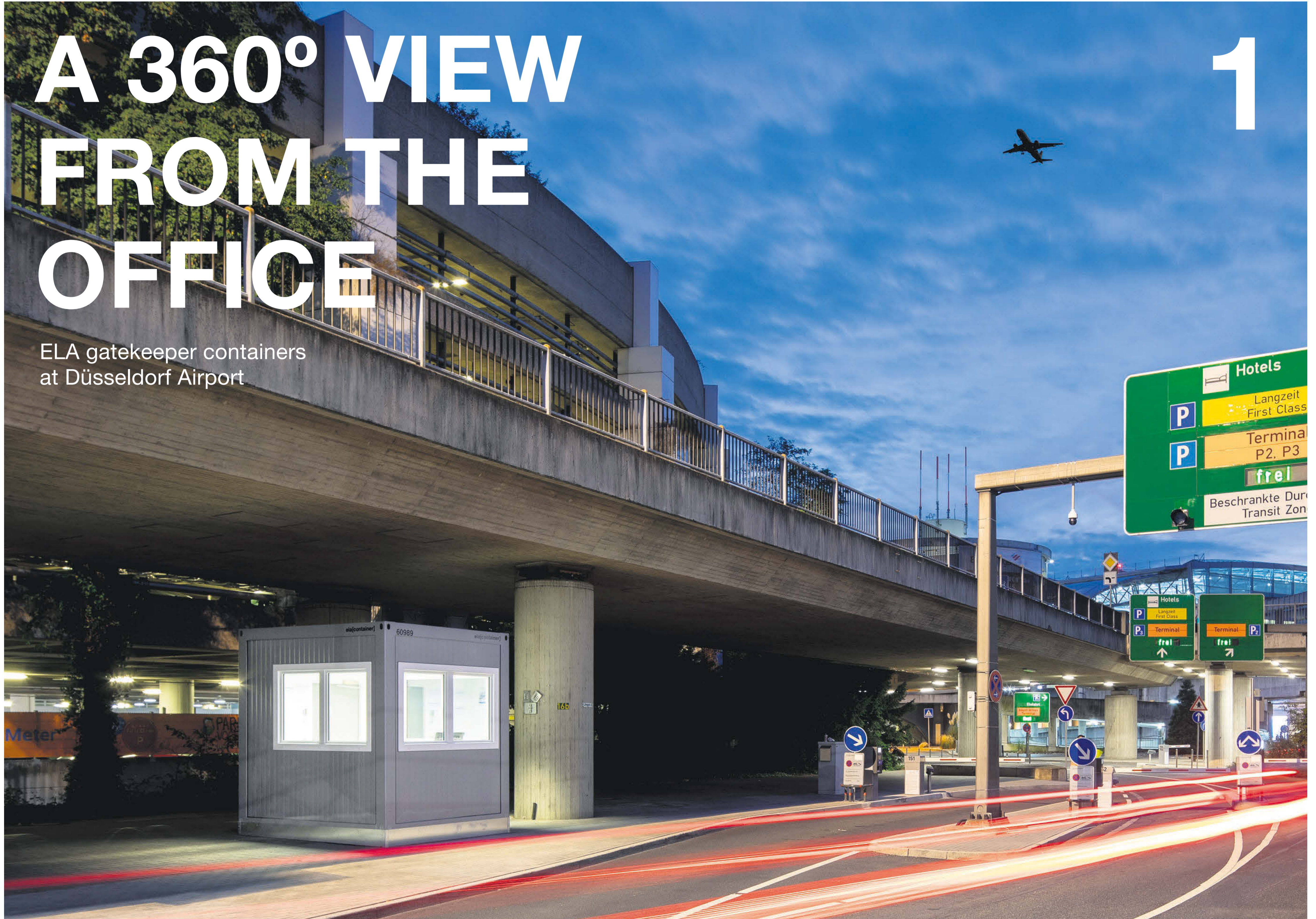
Düsseldorf Airport never sleeps: SITA Airport IT GmbH manages parking operations from ELA gatekeeper containers.

ELA gatekeeper containers at Düsseldorf Airport