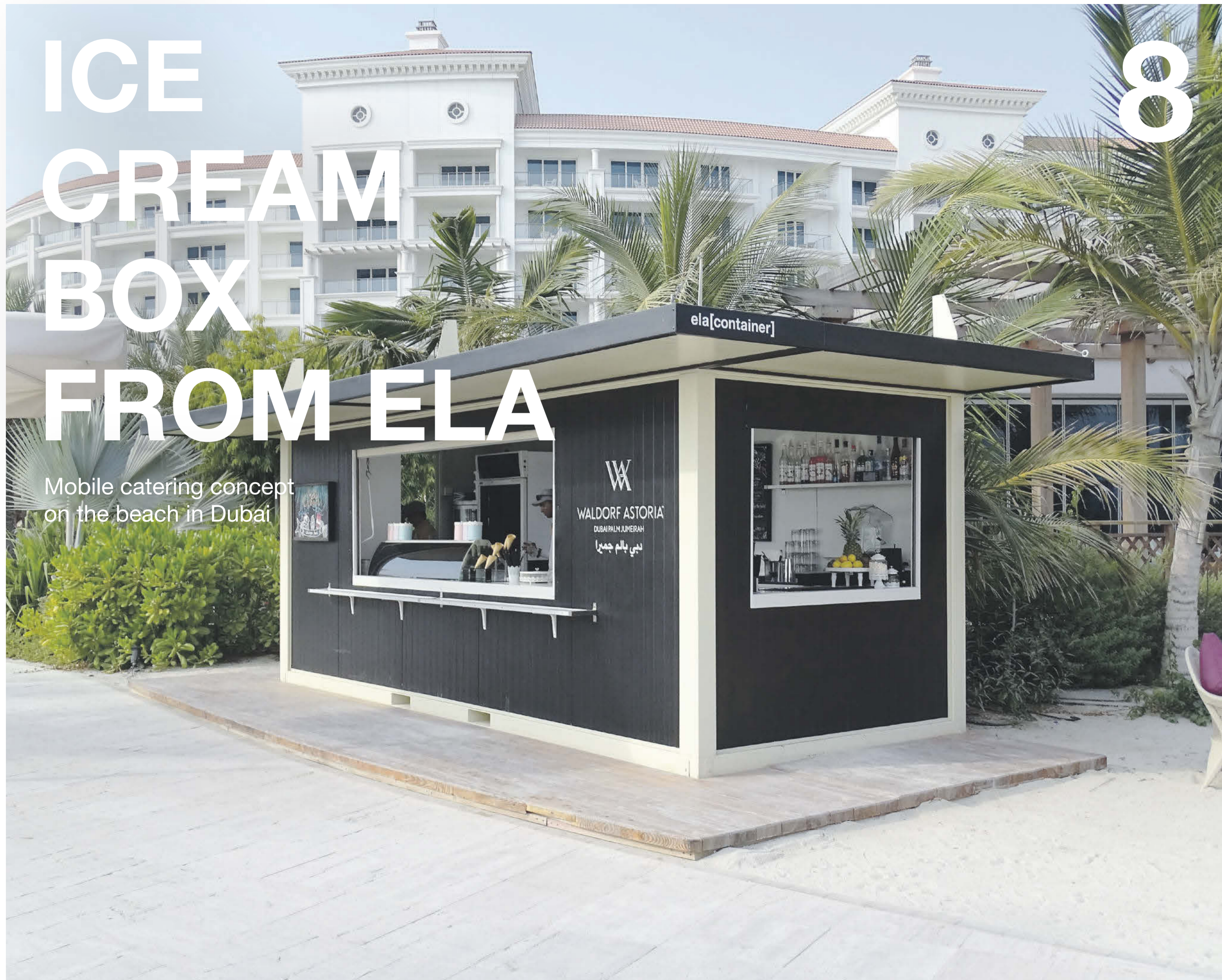
The ice cream box fits in perfectly with the elegant surroundings of the luxury hotel.

Mobile catering concept on the beach in Dubai