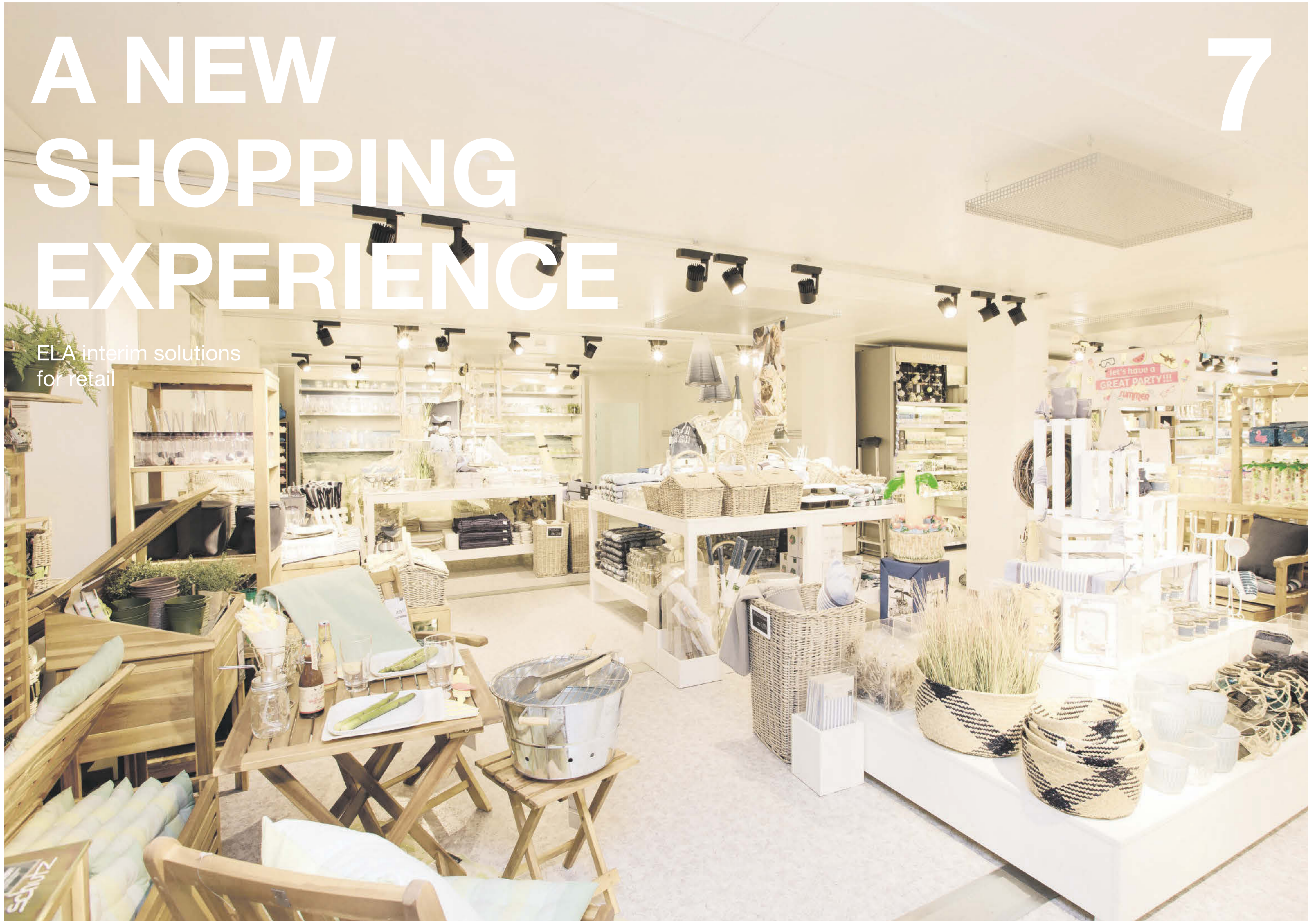
The multi-functional sales rooms from ELA set the scene perfectly for retail goods.