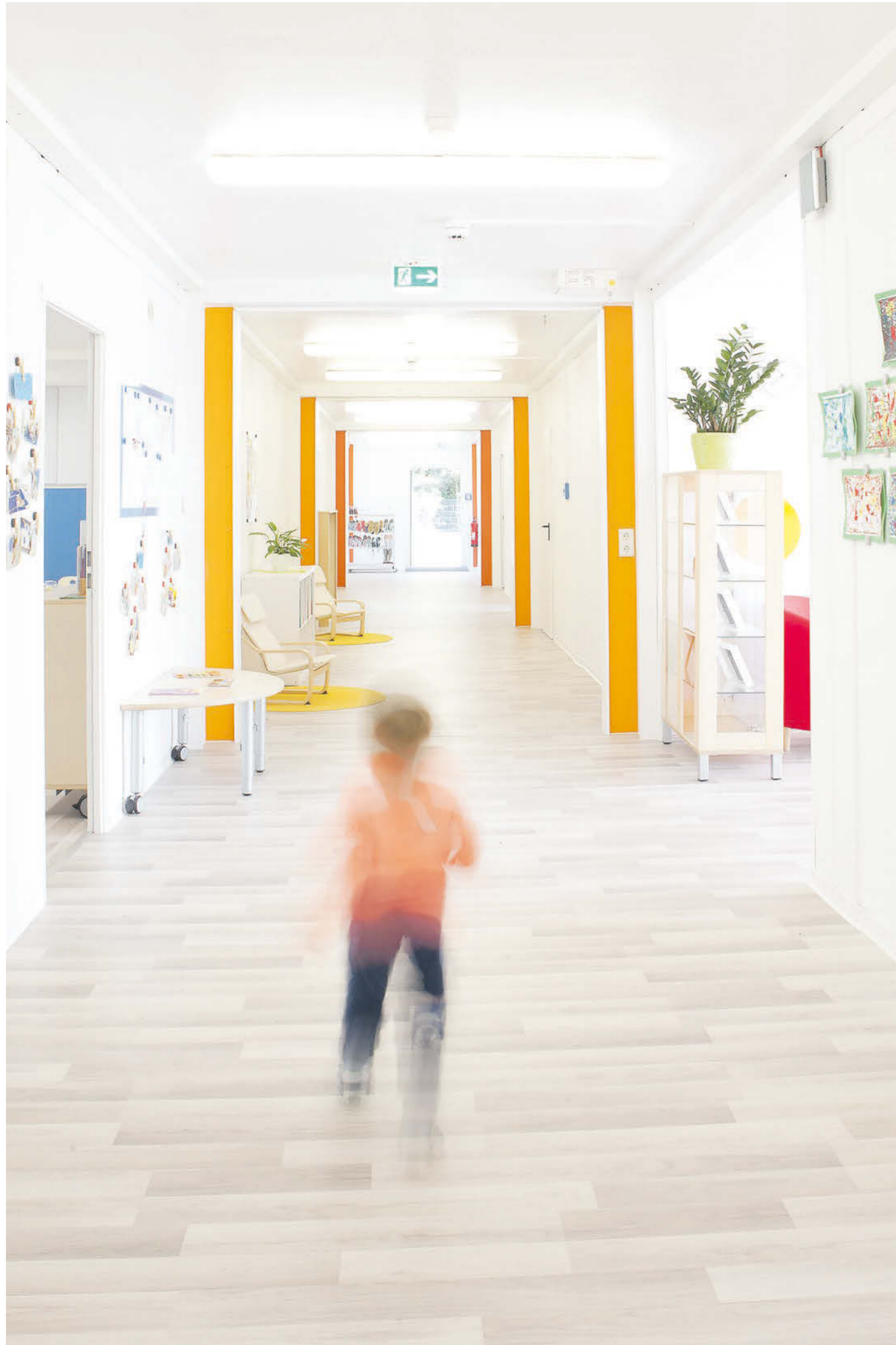
Free rein: the new kindergarten is the perfect location for play and physical activity.