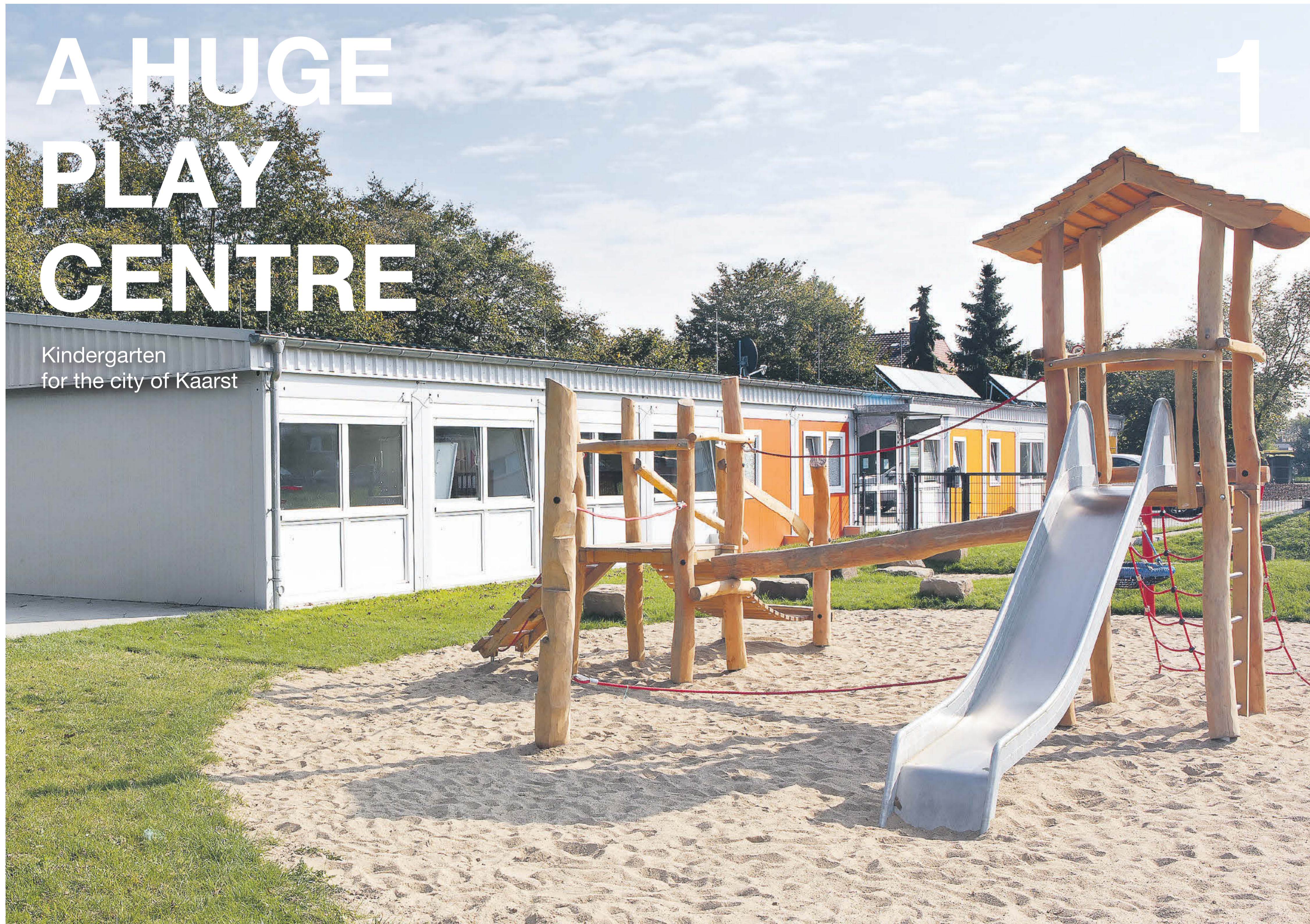
Flexible solution: the city of Kaarst had these ELA modules converted into a kindergarten.