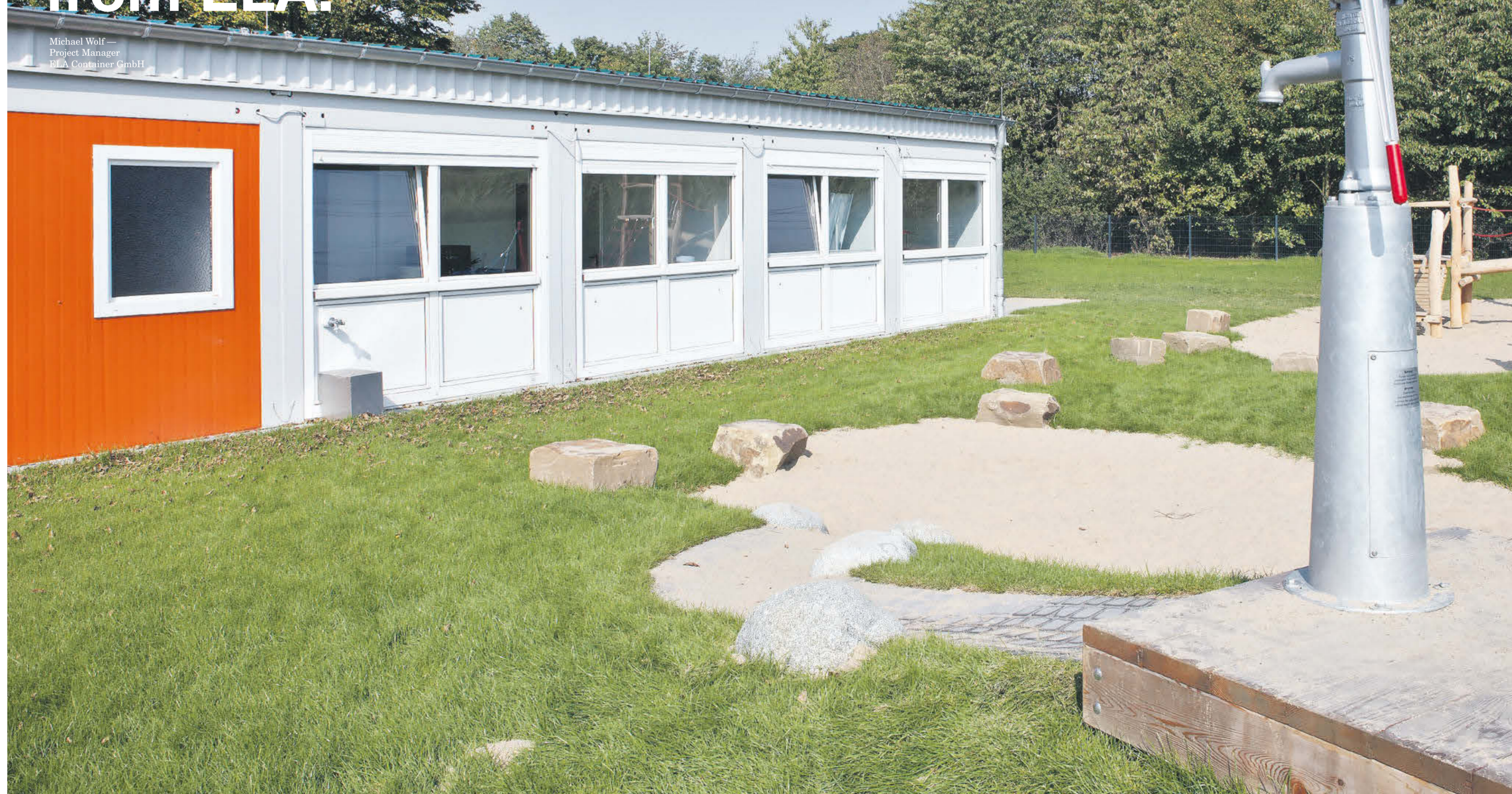
The kindergarten is composed of ELA module rooms and integrated into spacious outdoor grounds with play equipment.

Michael Wolf — Project Manager ELA Container GmbH